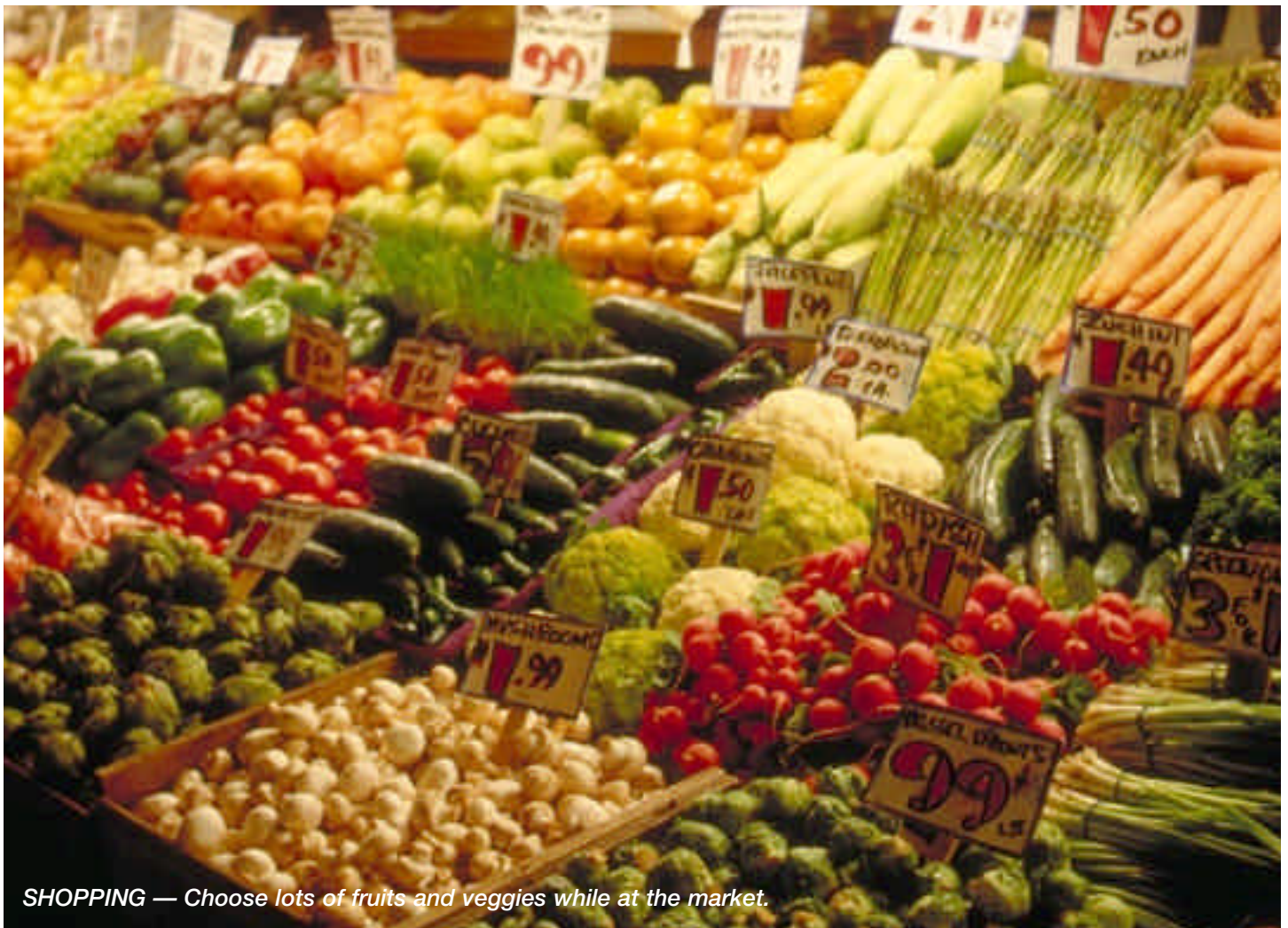
SHOPPING — Choose lots of fruits and veggies while at the market.

it's starving. Eating low calories for too long will slow down your metabolism. The cheat meal is good for you psychologically also. You won't feel deprived. You might be wondering about food supplements and if any of the fatburners available would help when following this plan. Some are helpful and some are a total waste of money. Many of the products use slick marketing gimmicks to make them appear as if they can magically transform you into a fitness model. Before you spend your hard-earned money on any of these products, do some research on the internet at sites like www.quack-watch.org . You may also want to talk to a knowledgeable nutritionist like PJ Bowen of Max Muscle in Lancaster, CA. Educate yourself so you don't waste your money on modern-day snake oil. To make this program a little easier to understand, I've set up a sample week for you to