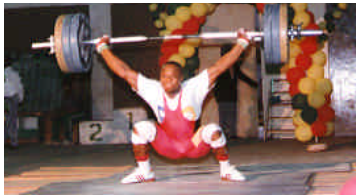
TRAINING — Getting ready for the Olympics.